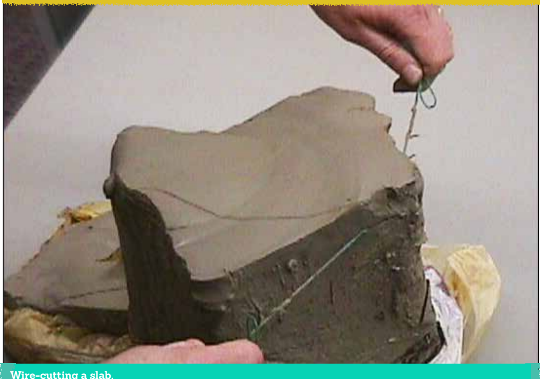
Wire-cutting a slab.